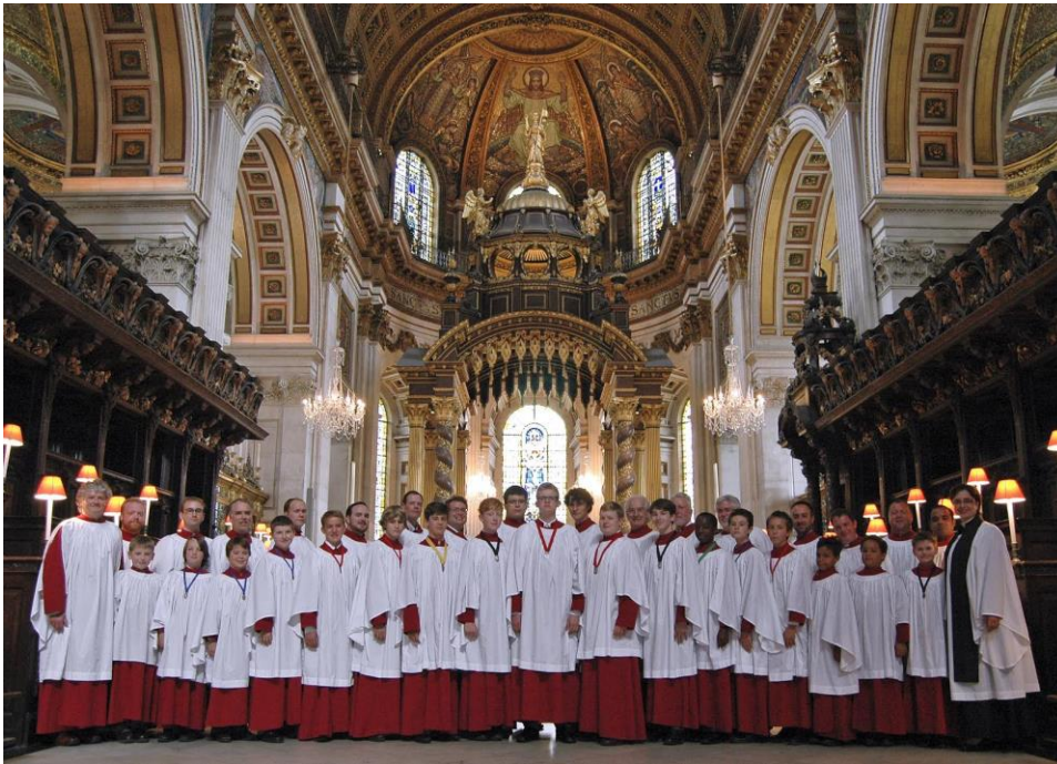
The Choir of Men and Boys of Christ Church Cathedral, Ottawa, at St. Paul's Cathedral, London