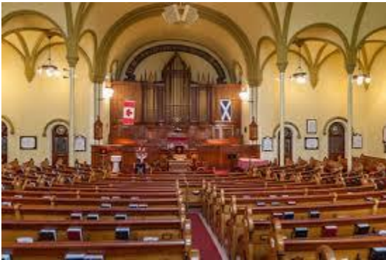
St. Andrew's Presbyterian Church, interior