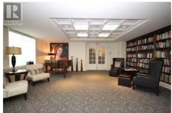
The Royal George party room