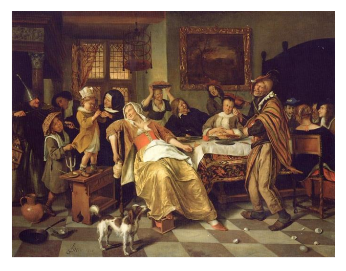
Jan Steen, 1668. Twelfth Night