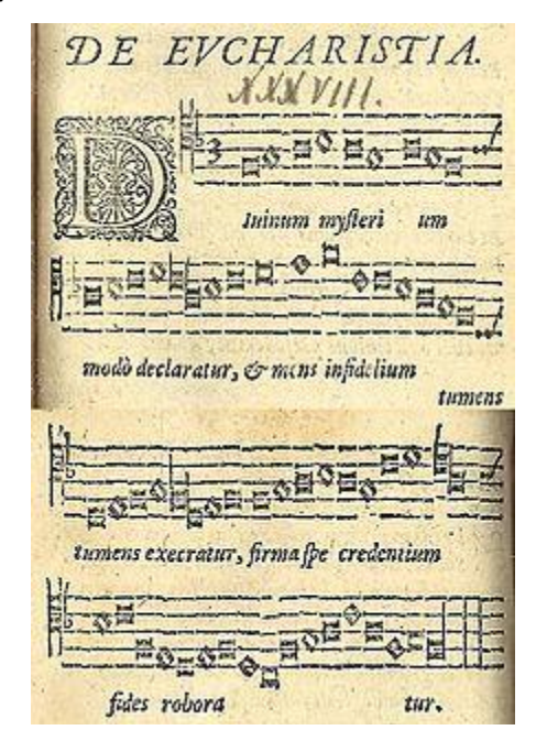
Of the Father's love begotten began as a Eucharistic hymn, Divinum mysterium. This presentation, in triple time, is from the Finnish Piae Cantiones, 1589.

Nineteenth century antiquarians rediscovered early carols in museums (according to the Encyclopædia Britannica , about 500 have been found). Some are religious songs in English, some are in Latin, and some are "macaronic" — a mixture of English and Latin. The