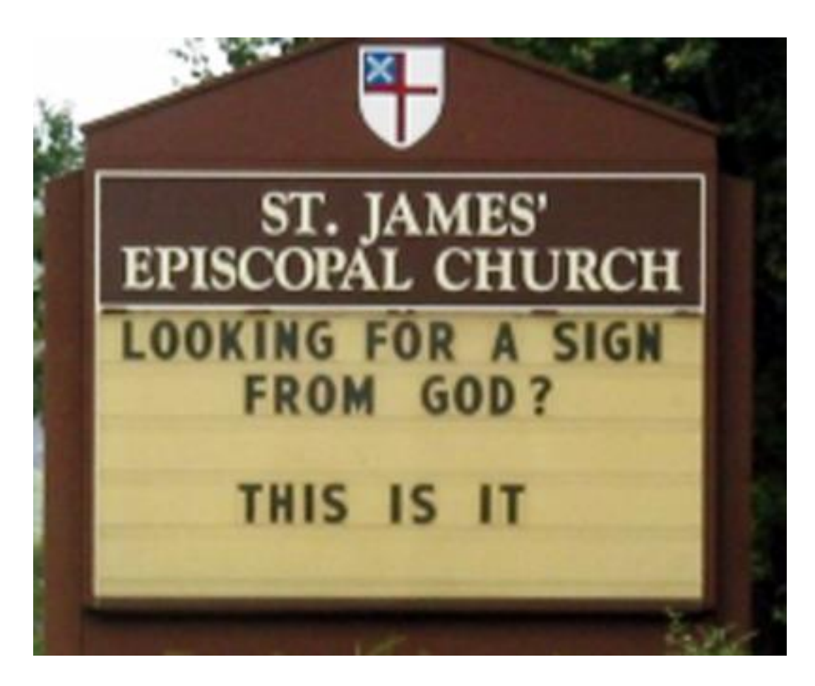
We're told that Emperor Constantine said, In hoc signo vinces! (In this sign we conquer), although in fact he spoke Greek, not Latin. But do you suppose this could be what he meant? See <a href="http://en.wikipedia.org/wiki/In_hoc_signo_vinces">http://en.wikipedia.org/wiki/In_hoc_signo_vinces</a>