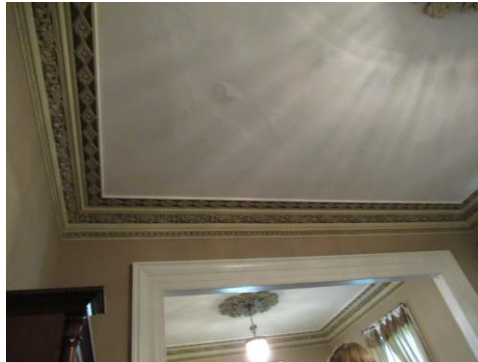
Elegant molded plaster ceiling in the Museum's historic Stevenson House