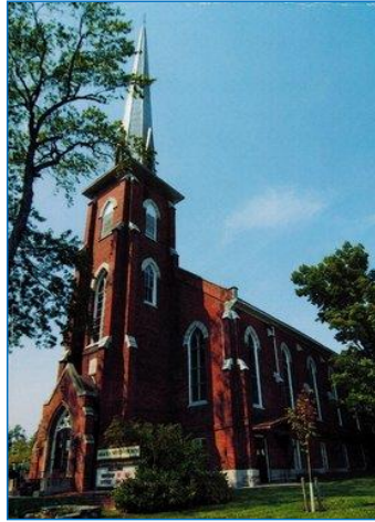
Grace United Church, Napanee

century, the consensus of the visitors that day was that its effectiveness is limited. Partly this was the effect of the normal tonal designs of the late 1930's, with little upperwork and often only 8' reeds. No doubt the tonal finishing also was limited by wartime conditions, with many highly