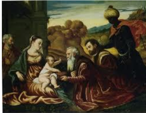
The Adoration of the Magi Polidoro da Lanciano

But peaceful was the night When such music sweet Their hearts and ears did greet, As never was by mortal finger strook, Divinely warbled voice Answering the stringed noise, As all their souls in blissful rapture took: The air such pleasure loth to lose, With thousand echoes still prolongs each heav'nly close.