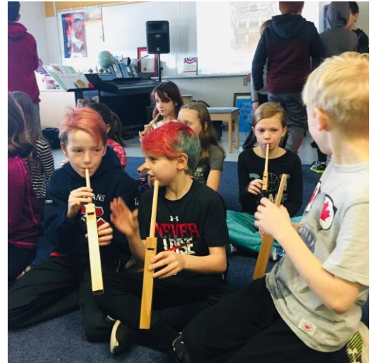
Making the pipes 'sing'!

From February 21-27, 28 K-6 classes had the opportunity to put on their Science, Technology, Engineering, Arts, and Math hats to assemble a fully functioning pipe organ. The OrgelkidsCAN program, sponsored by the Royal Canadian College of Organists and manufactured by the Létourneau Organ Company (Orgues Létourneau) from Saint-Hyacinthe, Québec, reached almost 700 students. Classes loved the hands-on and inquiry based learning, making the pipes "sing", figuring out how to construct the organ and were very intrigued by the lack of electricity or electronics, and how every part was mechanically connected. Most of all, they loved playing, selecting the stops to use, and pumping the bellows.