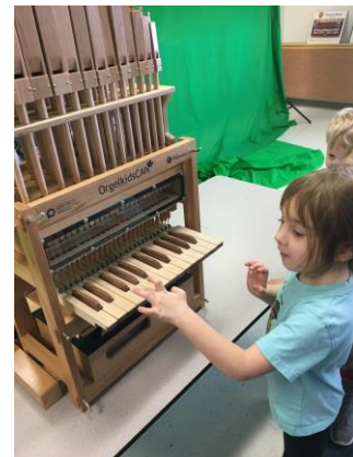
The finished product!