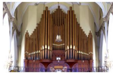
St. Mary's Cathedral, Kingston, Ontario

To view a photo of our Centre Executive, visit the Executive page. For photos of past Centre events, browse our quarterly newsletters, links to which may be found on our Newsletter page.