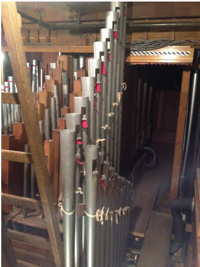
The Gt./Pos. 8' / 4' Trumpet