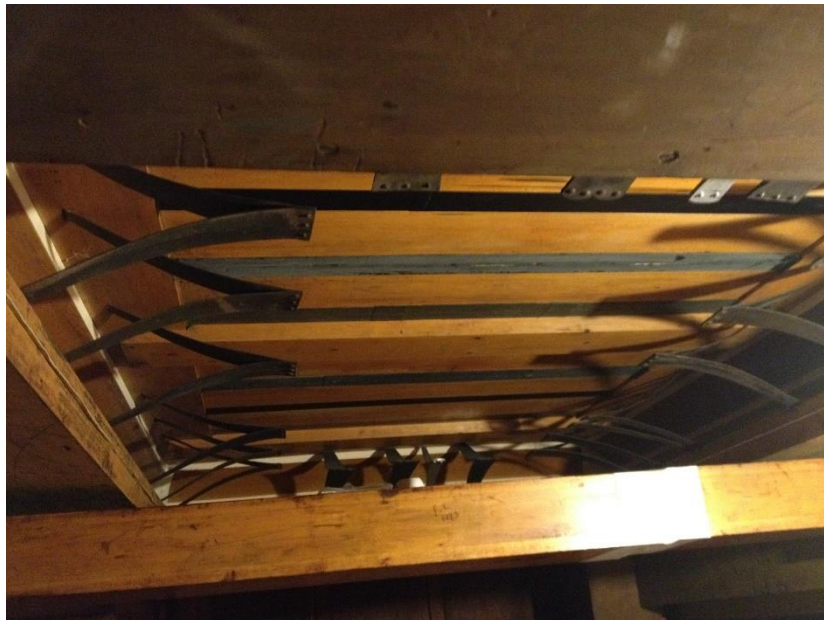
Schwimmer under the positiv chest