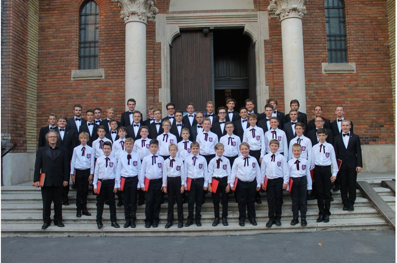
The Boys' Choir of St. Martin, Biberach