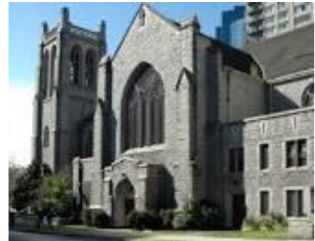
St. Andrew's-Wesley United Church, Vancouver

https://www.youtube.com/watch?v=7yS9WbKsj2k&t=107s .