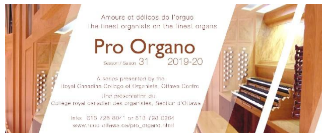
Above: Pro Organo series brochure, front cover Left: All Saints' Cathedral, Halifax.