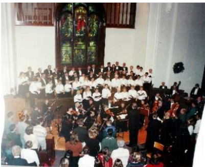
The reconstructed choir loft, with the window advanced eleven feet, and the whole organ relocated behind it. Later the stage was extended, making more space for liturgical use, and for orchestral players on special occasions.