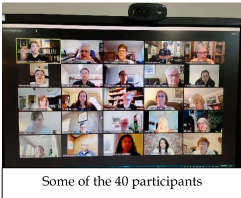
Some of the 40 participants